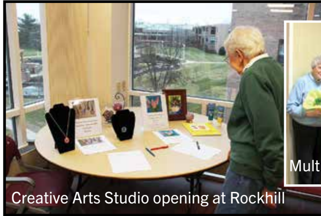
Creative Arts Studio opening at Rockhill