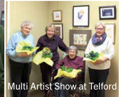
Multi Artist Show at Telford