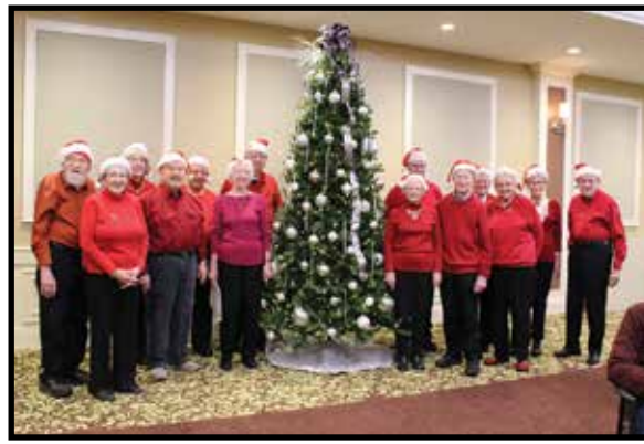
The Community Players Drama Group, featuring residents from both Community at Rockhill and Lutheran Community at Telford.