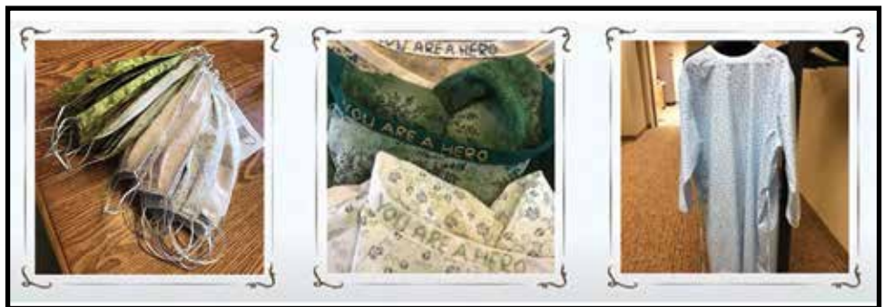
Thank you to our volunteer sewers on both campuses who helped provide masks for residents and gowns for non-medical staff in additional areas of care. A special thank you to JOANN Fabric and Craft Stores for donating fabric and Little Zion Lutheran Church at Indianfield for both fabric donations and sewing.